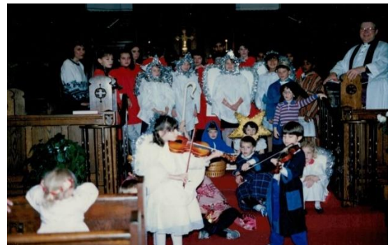
Christmas 1988 at St. Matthew